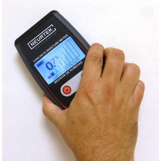
Colocar y Apretar